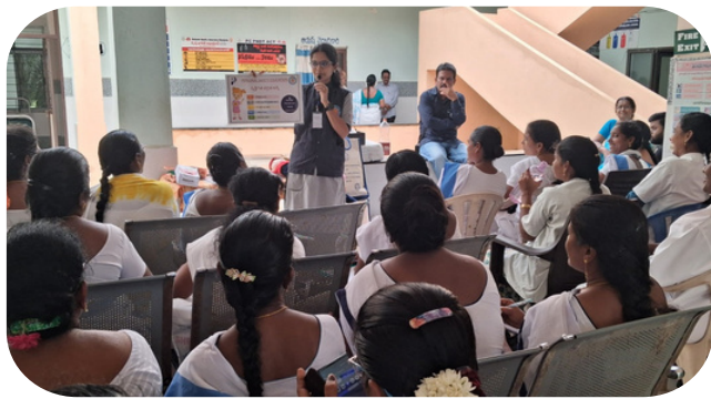
SFLB TOT - ASHA, ANM

In AV Nagaram, Chebrolu, Gollapalem & Duggudur our SFLB Training of Trainers sessions took a powerful new direction—this time with ASHAs, ANMs, and MLHPs, the frontline health workers who care for our communities every day. With the support of the DMHO, they were trained on key child safety topics. These real-life heroes are now better equipped to protect and empower the youngest members of our villages—proving that child safety isn't just a teacher's responsibility, but a shared mission for all.