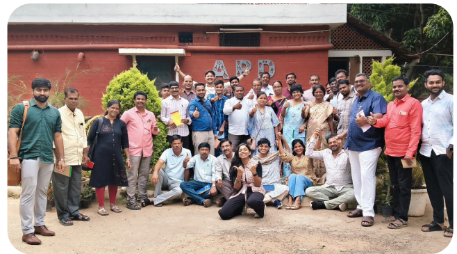
Niranthara Sahayak Program at Bangalore

PCT fundraising team recently participated in the dynamic 3-day Niranthara Sahayak Program (NS 6 – Andhra Pradesh) in Bengaluru, gaining powerful insights into fundraising, donor management, and social impact marketing. From writing compelling project proposals and crafting persuasive donor pitches to mastering storytelling, social media strategy, CSR laws, and retail fundraising – the experience left our team supercharged and ready to take PCT’s mission to the next level